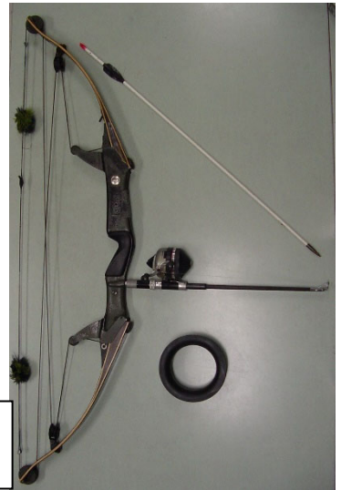
Example bow, archery fishing set-up and fishing arrow.