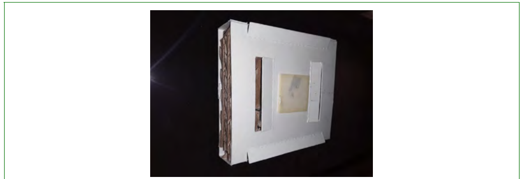
Figure 2-7 Wall Trap with Back Entry Tabs Opened Correctly

Be aware that the trap adhesive or tape (if used) may remove some paint from walls when the trap or tape is removed. Let the facility know this. You may need to choose a less prominent location.