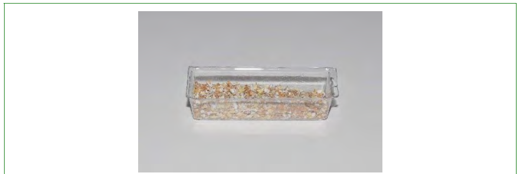
Figure 2-4 Plastic Collection Tray with Wheat Germ