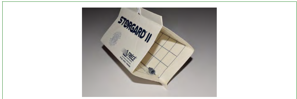
Figure 2-5 Decoy Aerial Trap with Khapra Beetle Pheromone Lure