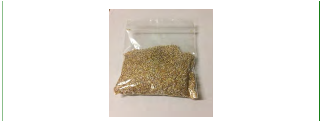
Figure 2-3 Organic Wheat Germ