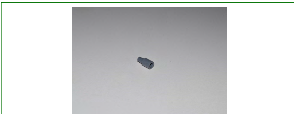
Figure 2-2 Khapra Beetle Pheromone Lure