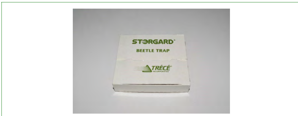
Figure 2-1 Khapra Beetle Wall-Mounted Trap

Fit the decoy aerial trap with one of the khapra beetle lures and hang it high in the open head space of the building. Use one aerial trap for every five to six khapra beetle wall-mounted traps.